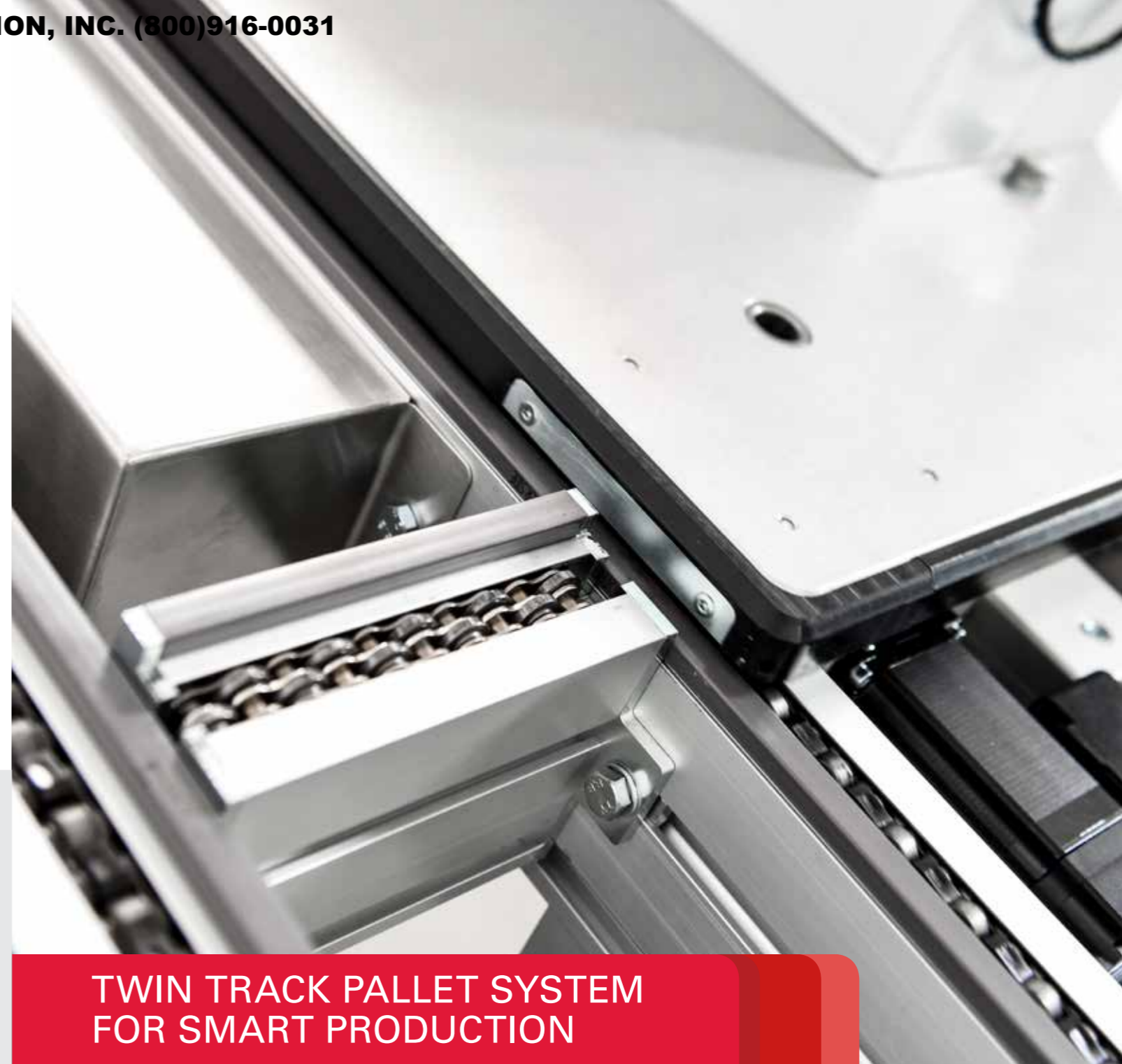
TWIN TRACK PALLET SYSTEM FOR SMART PRODUCTION